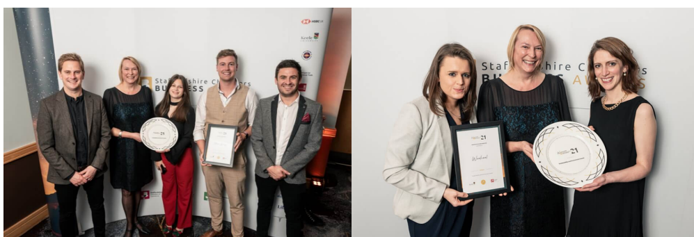
Woolcool and The Stone Group - joint winners of the Sustainability and Environment Award